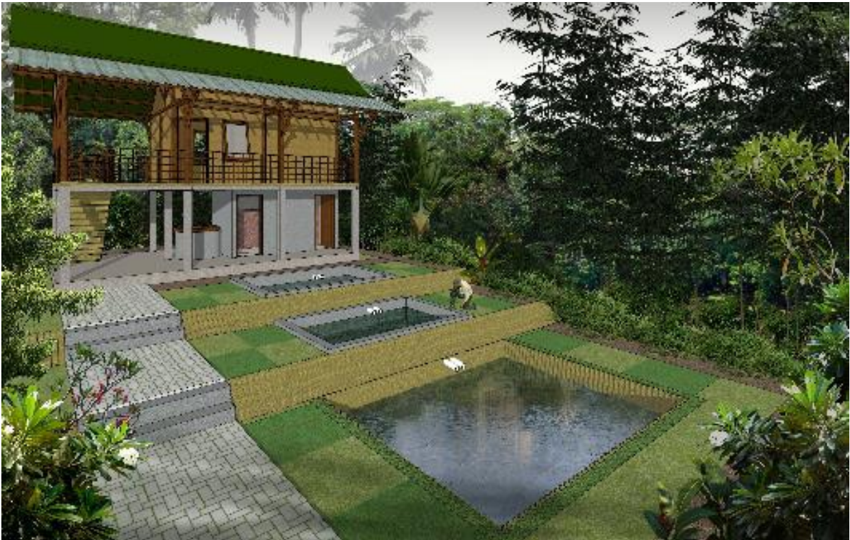
Figure 2. The eco-friendly house site concept

There is some photo documentation of the construction or implementation phase, as depicted in Figure 3 . Start from site preparation on July 2020, the structural phase for foundation-beam and column construction, the total structure until roof structure builds up, and the stair construction until the coverage wall from bamboo material is done on 17 th November 2020. There is also documentation of fishpond construction, the two drum for rainwater harvesting, and the cow manure/dung reservoir to process and produce biogas. The total cost for the building, pond and utilities was approximately around 25 million rupiahs. On 19 th November, this house was launched by ITB vice director of research and community service institution. There is the full team researcher, invited community and the final building figure. The community surrounding this facility could come, join several activities, and hopefully imitate this housing prototype.