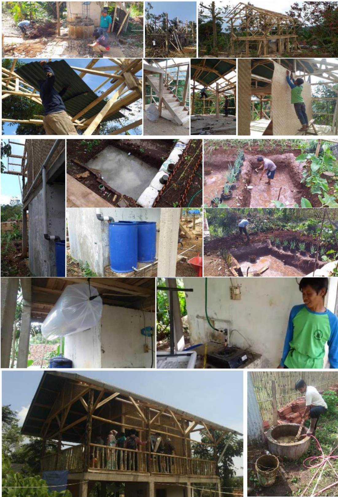
Figure 3. The implementation of eco-friendly housing